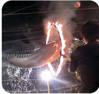
This dolphin, kept in a traveling circus, jumps through a hoop of fire for the amusement of the audience

Dolphins and whales are very intelligent. They have large, complex brains; they are self-aware; and they create complex languages. Their experience of the world is similar to our own. They should not be forced into a life of servitude any more than people should.