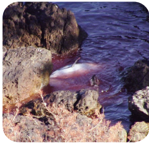
The water runs red with blood from dolphin slaughters

Many of the dolphins you see in captivity were caught from the wild. Some were captured during a so-called drive hunt, which involves chasing wild dolphins with motorboats and herding them into shallow water. A few "show quality" individuals are then chosen for a life in captivity, with no hope of ever being reunited with their families or their ocean home.